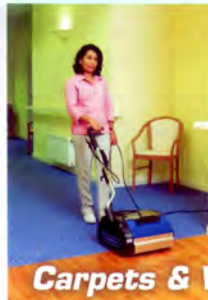
Carpets & Vinyl