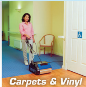
Carpets & Vinyl